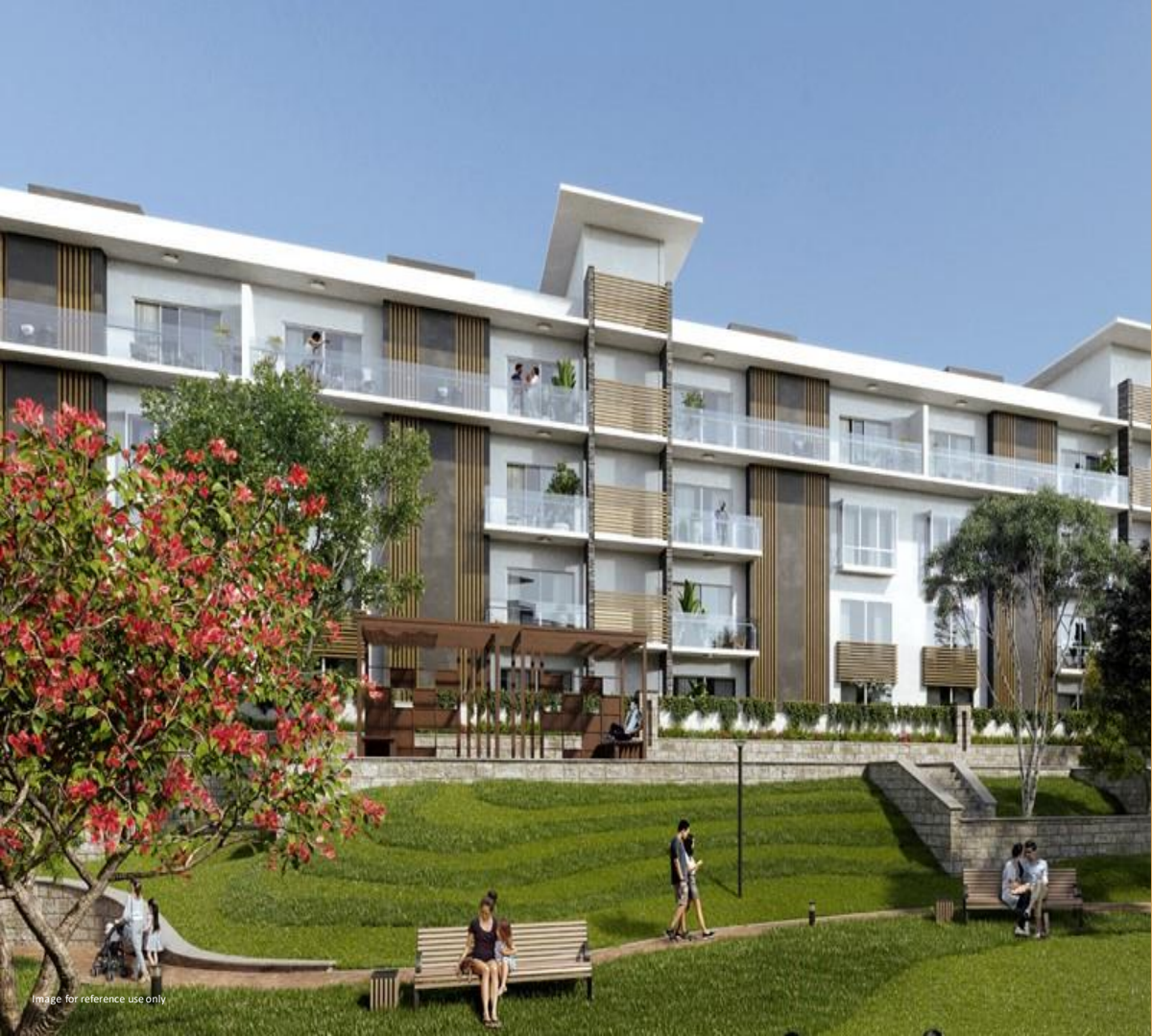
Image for reference use only